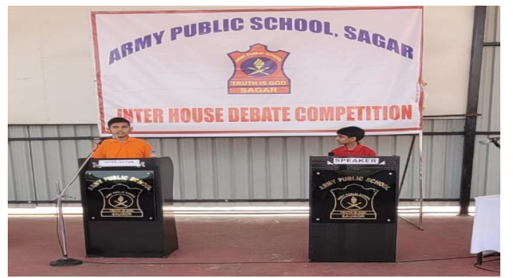
Inter-House English Debate Competition was held for Group B on the topic 'Is Peer Pressure Harmful or Beneficial to Individuals'.