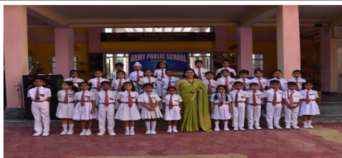
CLASS MONITORS OF CLASSES 1 TO 5