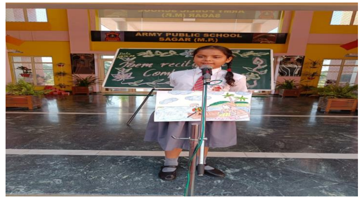
Poem Recitation Competition was held for classes 1 to 5.