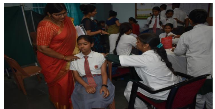
JE vaccination to prevent Japanese Encephalitis for the age of 1 to 15 years was done at APS and Foundation Wing for the students those whose parents were willing and have submitted the consent letter.