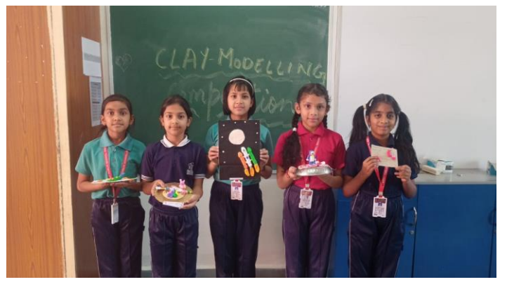
Clay Modelling Competition was held for classes 3 to 5 at APS.