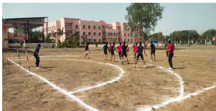
Inter-House Handball pre- match was held for Group A boys team