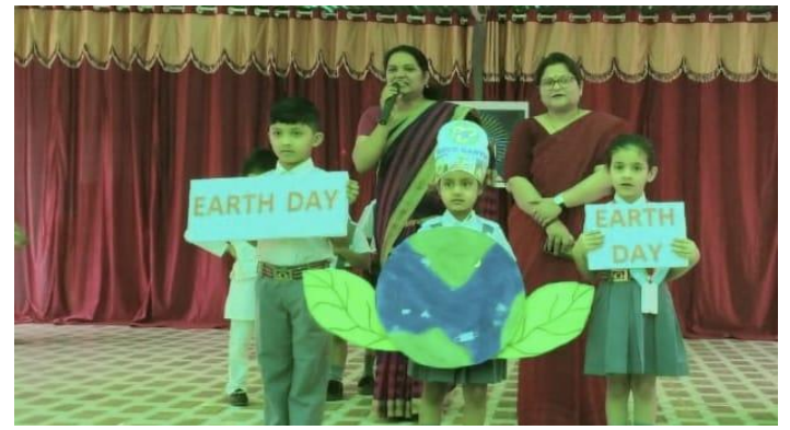
Mahavir Jayanti and World Earth Day - Colouring competition was held on the occasion of World Earth Day.