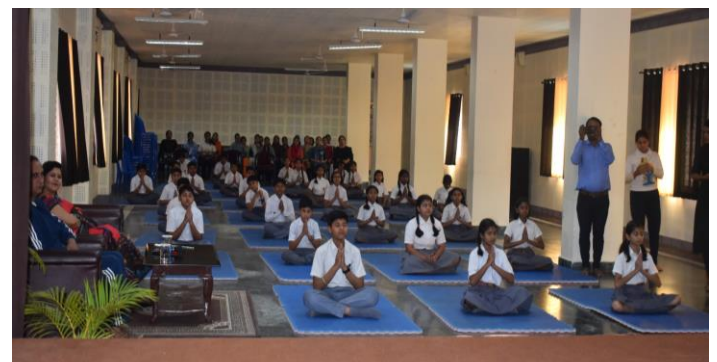
To celebrate International Yoga Day 21 June, 2024 Training Camp was organized from 25th April to 10th May 2024 by - Department of Yoga Education