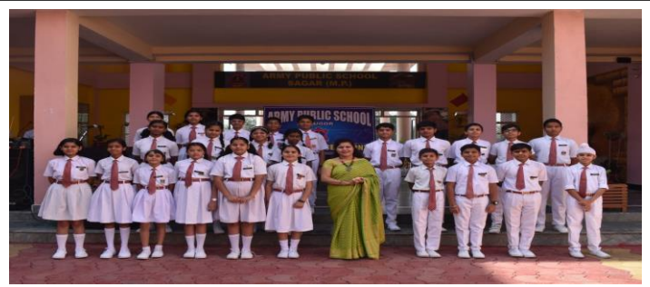
CLASS MONITORS OF CLASSES 6 TO 8