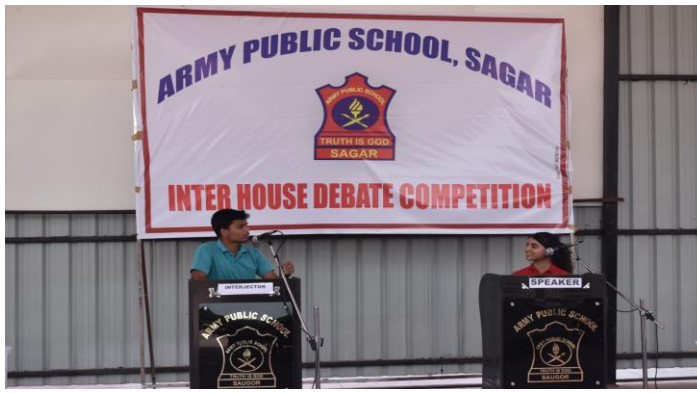
Inter-House English Debate Competition was held for Group A on the topic 'Intelligence is More Important than Emotional Intelligence'.