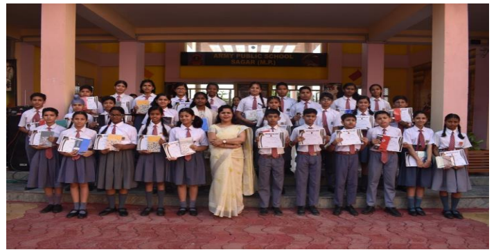
CCA Achievers Felicitation