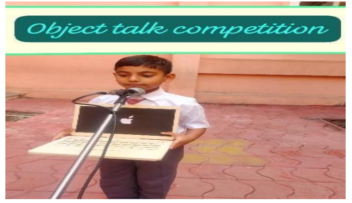
Object Talk Competition was held for classes 1 to 5 at APS.