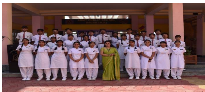
CLASS MONITORS OF CLASSES 9 TO 12