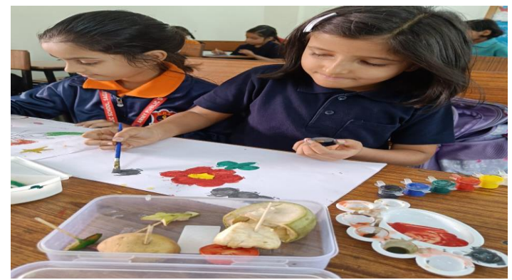
Vegetable Painting Competition was held for classes 3-5 at APS

"I NEVER DREAMED ABOUT SUCCESS. I WORKED FOR IT." – ESTÉE LAUDER