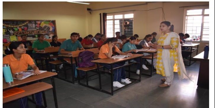
SIM, NDA, Extra Classes were conducted for the students from 3 rd May to 15 th May