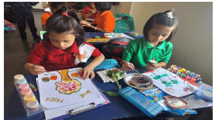
Vegetable Painting Competition was held for classes 1 & 2 at APS