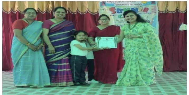
Prize Distribution at Foundation Wing