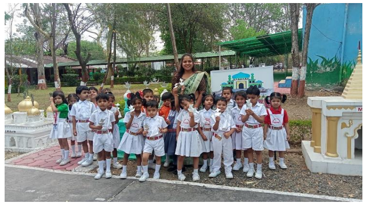
Siblings Day and Idul Fitr was celebrated in the assembly at the foundation wing. The event highlighted the love and bond between siblings and offered a wonderful opportunity for cultural learning and fostering unity among our pre-primary students.