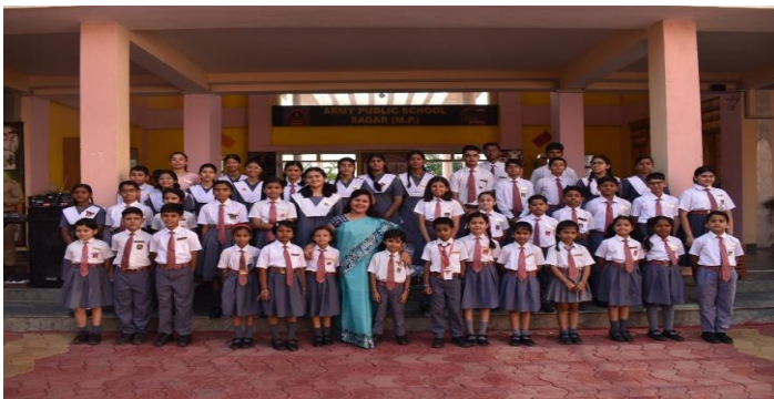
Fluent Speaker Badging