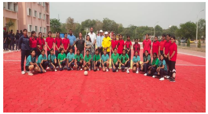
Inter-House Handball pre and final match was held for Group A Girls team in which Nehru house was the winner