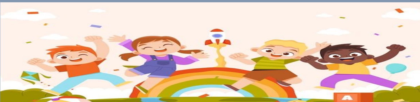
Clay Modelling competition for classes 1 & 2