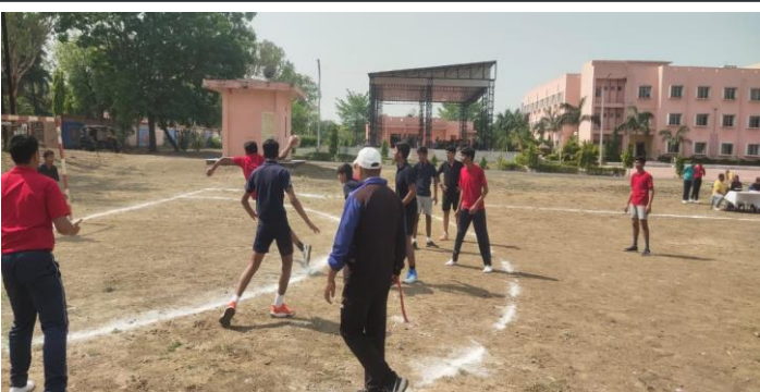
Inter-House Handball Final match was held for Group A boys team in which Gandhi house was the winner